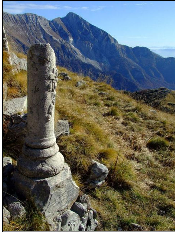
World War I Memorial near Dreznica

Today's hike continues on the Path of Peace, with stunning scenery of the Western Slovenian Alps, and passes by more outdoor museums and numerous chapels. We will hike to the little village of Dreznica, set high above the Isonzo valley. Heavy fighting took place in this area during WW1. Following our hike we will be transferred to the nearby town of Kobarid where we stay in a hotel. If there is time, we will visit the small military museum with its collection of war memorabilia and the nearby Napoleon Bridge with views of the mountains and Soča River. Ascent: 440 ft.; descent 3250 ft.; 13 miles. Approximately 6 ½ hours walking.