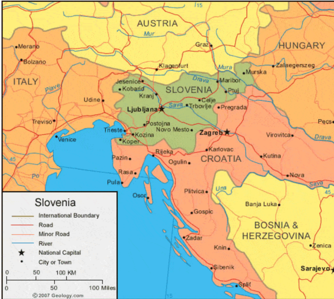
Slovenia's Place in Europe

A few words about Slovenia itself: it is a small country located in southern central Europe at the intersection of major trade routes and of the Slavic, Germanic, and Romance languages and cultures. Historically part of many empires including Rome, Austro-Hungarian, Venice, and France, it is currently a prosperous, democratic European country of two million persons. Over 50% of its landmass remains forested. It is exceptionally bio-diverse for its size particularly as pertains to endemic cave species.