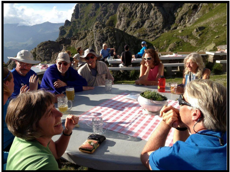
Relaxing together after a great day on the trail

When you participate in this activity, you should be in proper condition for the challenges outlined in this prospectus and equipped with appropriate gear. You should always be aware of the risks involved and conduct yourself accordingly. You are ultimately responsible for your own safety. Prior to your acceptance as a participant in this trip, you will be asked to discuss your capabilities and experience with us. We may also request references to confirm your fitness level and suitability for participating in trip activities. Please do not be offended by our questions.