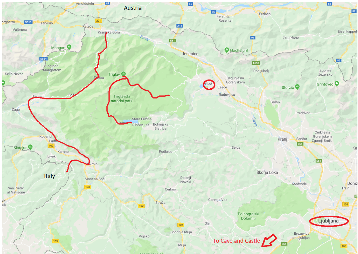
Map of the Region of Slovenia showing our sites and trekking routes