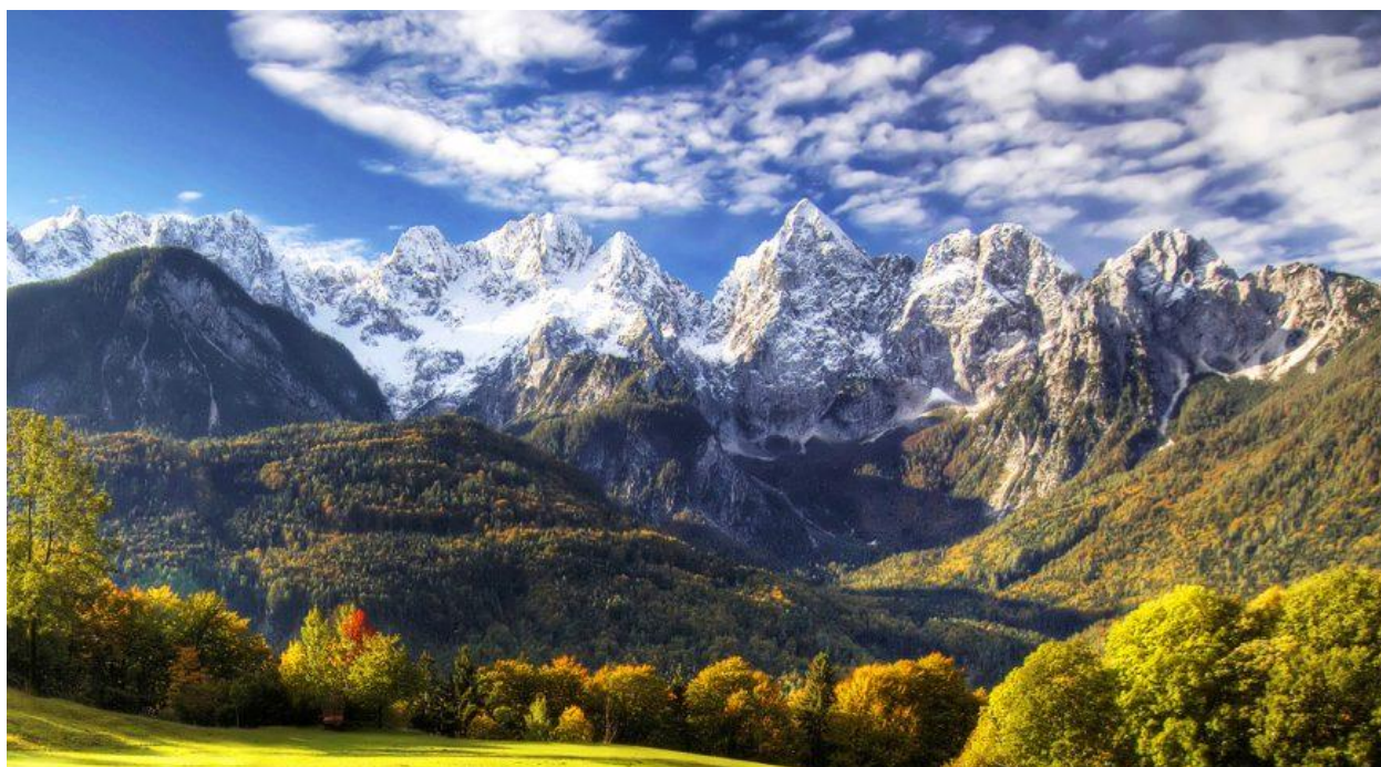
Triglav National Park

July 9, 2022 – July 23, 2022 (trip# 2211)